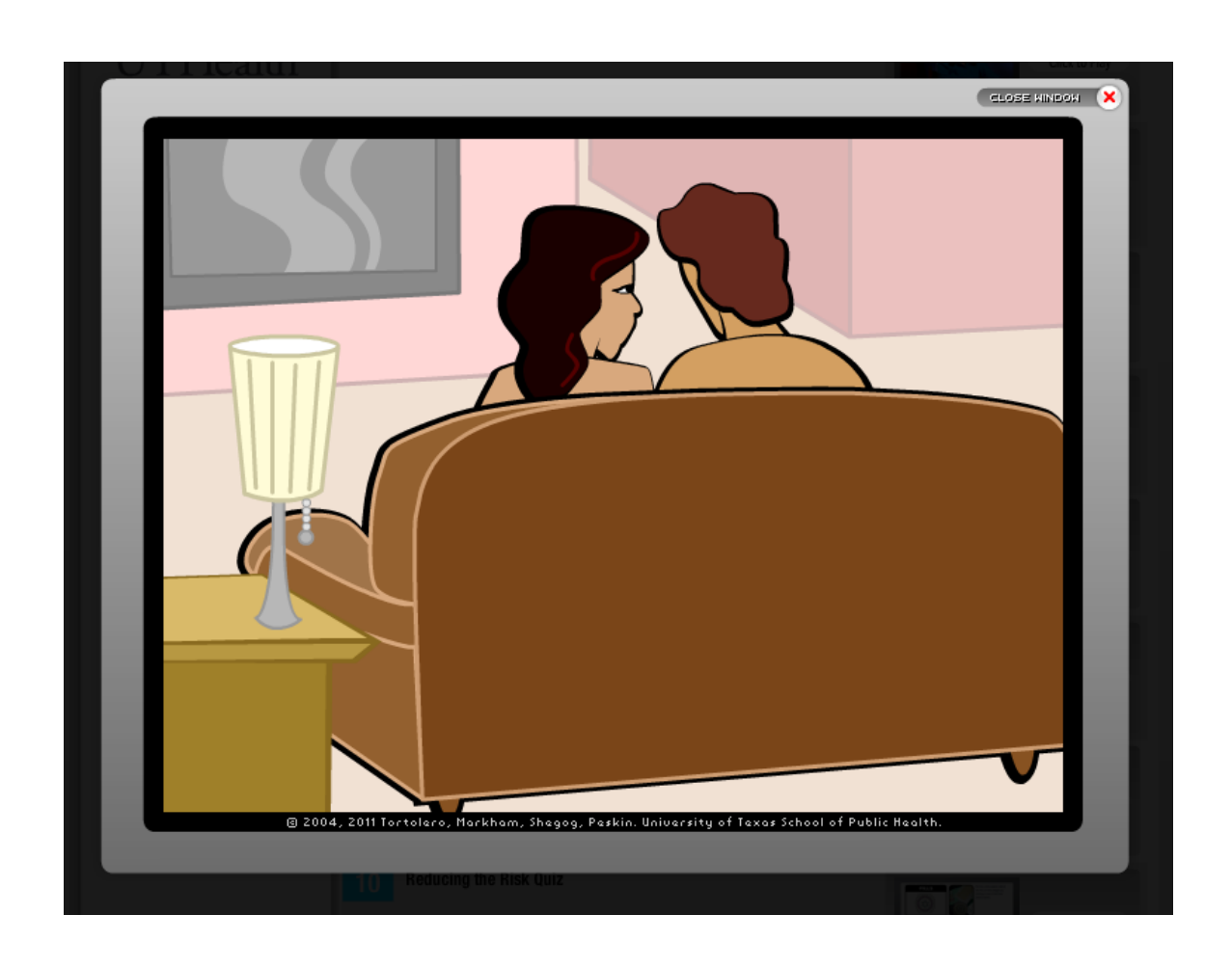
<u>Lesson 5 – Segment 4 – Marvin's Story –</u> Talking Condoms, Marvin has a really hard time putting a condom on and makes a lot of mistakes, "glow in the dark" condoms, "pre cum stuff on it", "that special moment"